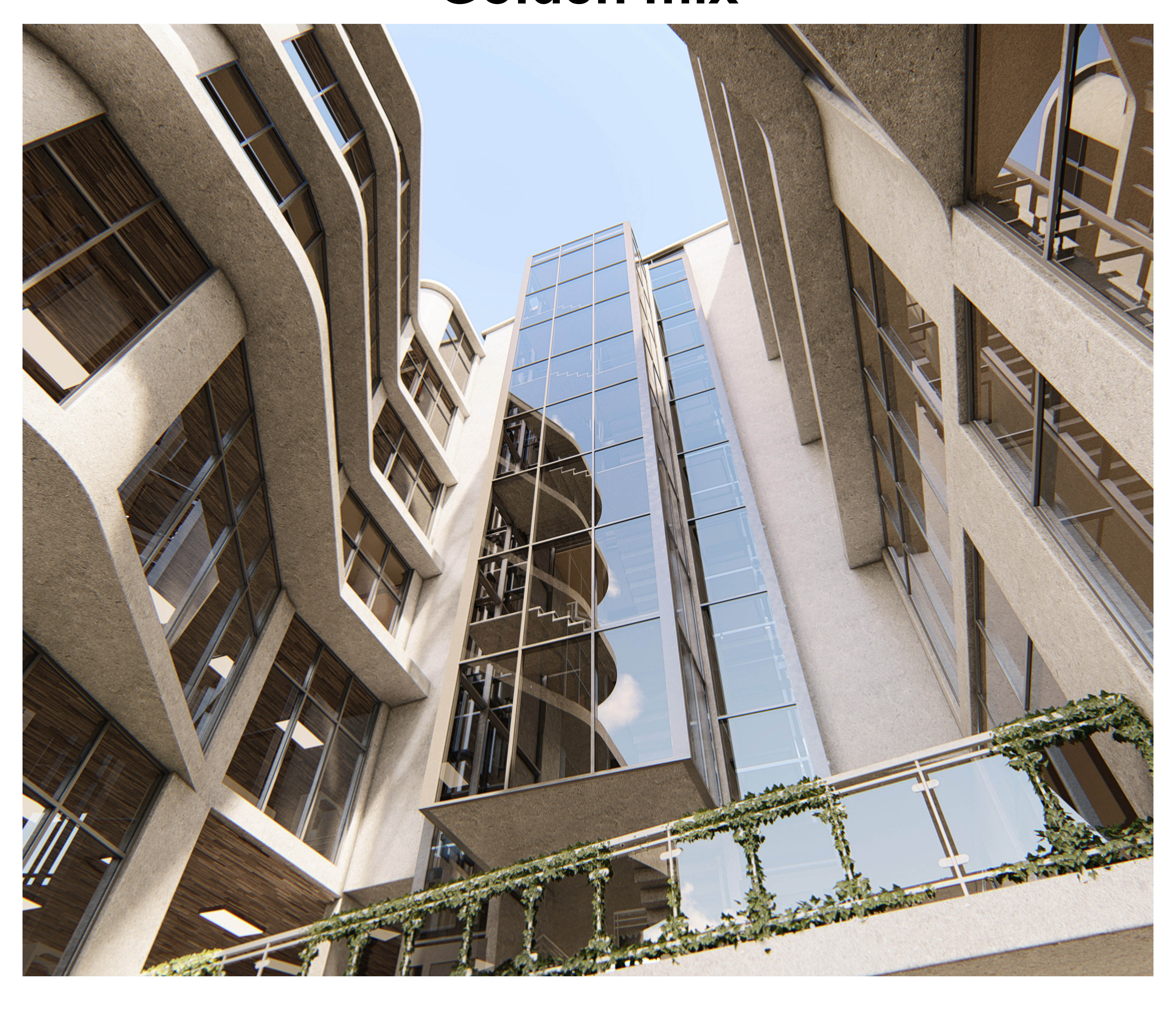
Created with AutoCAD and rendered with Revit